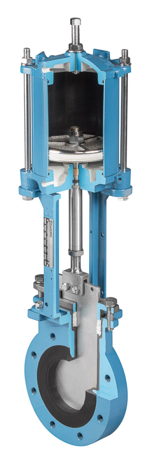
DeZURIK KUL Urethane Knife Gate Valves have a continuous bonded urethane liner throughout the entire body, chest, packing chamber and flange face area.

All wetted surfaces of DeZURIK KUL Urethane Knife Gate Valve Bodies are lined with urethane. The bonding process enhances the mechanical and abrasion resistance properties of the urethane, which creates a robust seat seal in harsh slurry services.